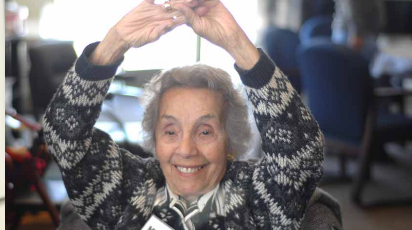
Health Trust programs bring physical activity to senior centers throughout Santa Clara County.