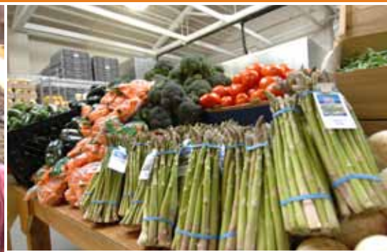
Fresh produce is available to HIV/AIDS clients at the new Health Trust Food Basket.