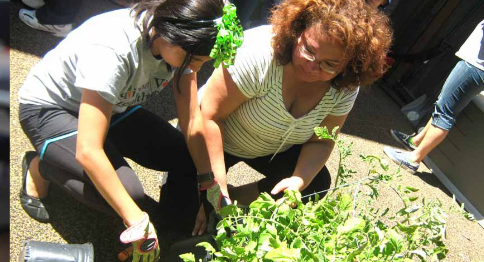
Community gardens teach families the joy of harvesting and eating fresh produce.