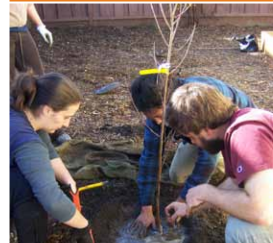
Silicon Valley HealthCorps members planted fruit trees on Martin Luther King Day.